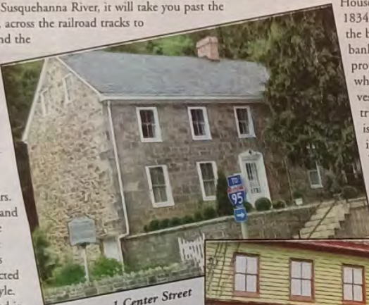
1 Center Street