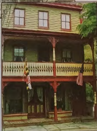
36 N. Main Street