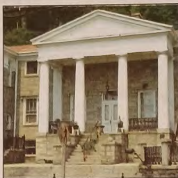
20 N. Main Street