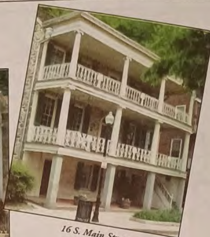
16 S. Main Street

The construction of the wings enlarged the building to house the Junior School and was named Jefferson Hall. The completed project was not seen by Jacob Tome for he died in 1898, but the structure remained a school until 1969 at which time it suffered a serious fire and was left in ruins until 1985. The building has been rehabilitated as a